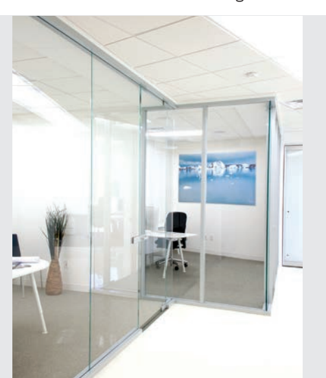
Privé® Framed Sliding or Pivoting